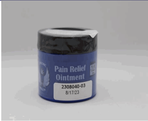
Residual Solvents (GC-MS) Analyzed: By: